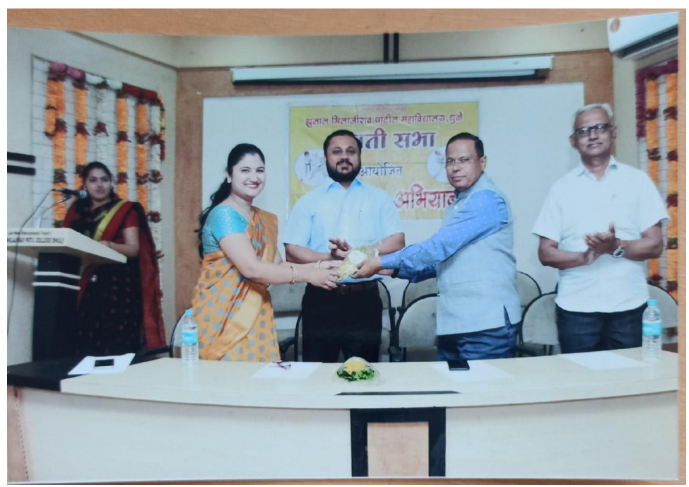
Inauguration of Judo and Karatetraining for selfDefense (Swayam Siddha Abhiyan)

Swayam Siddha Abhiyan for girls of all branches in the college was conducted from 18th February to 25th February 2020. Under this campaign, the students were trained in judo karate for eight days.