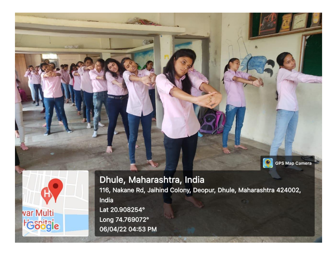
Judo Karate Workshop 6 to 13 April 2022