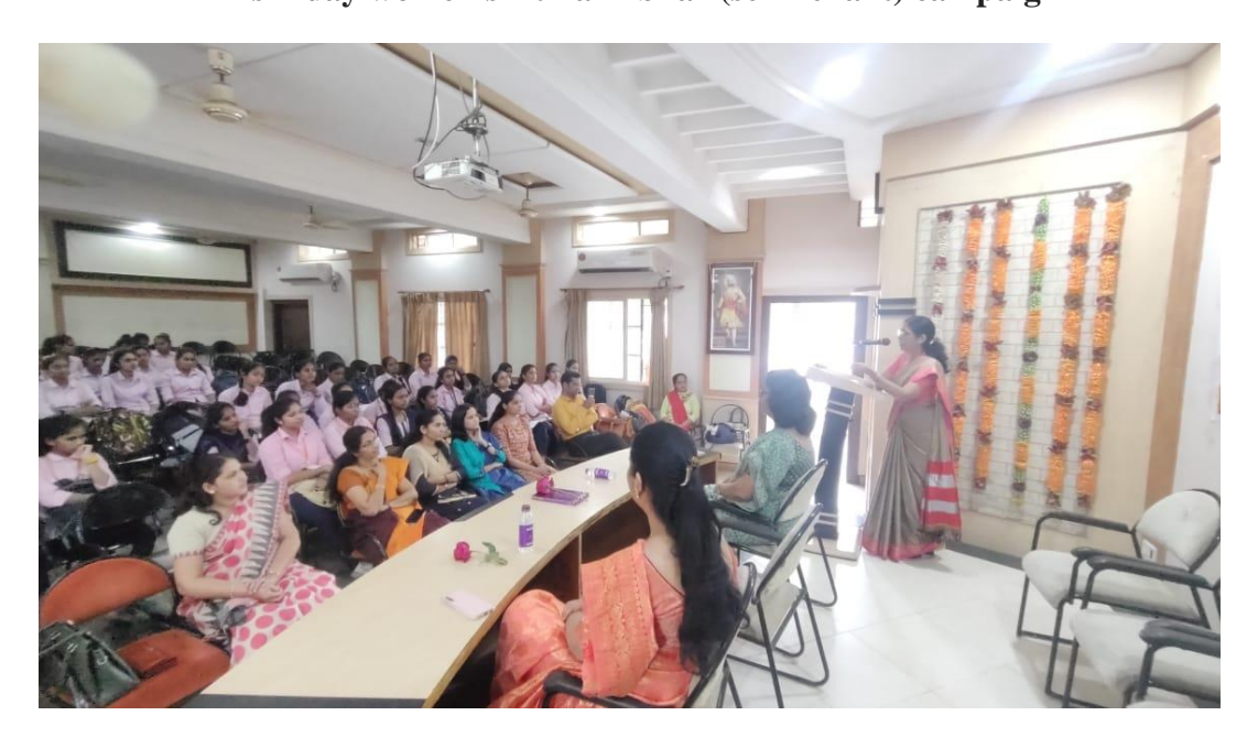
six-day women's Atmanirbhar (self-reliant) campaign