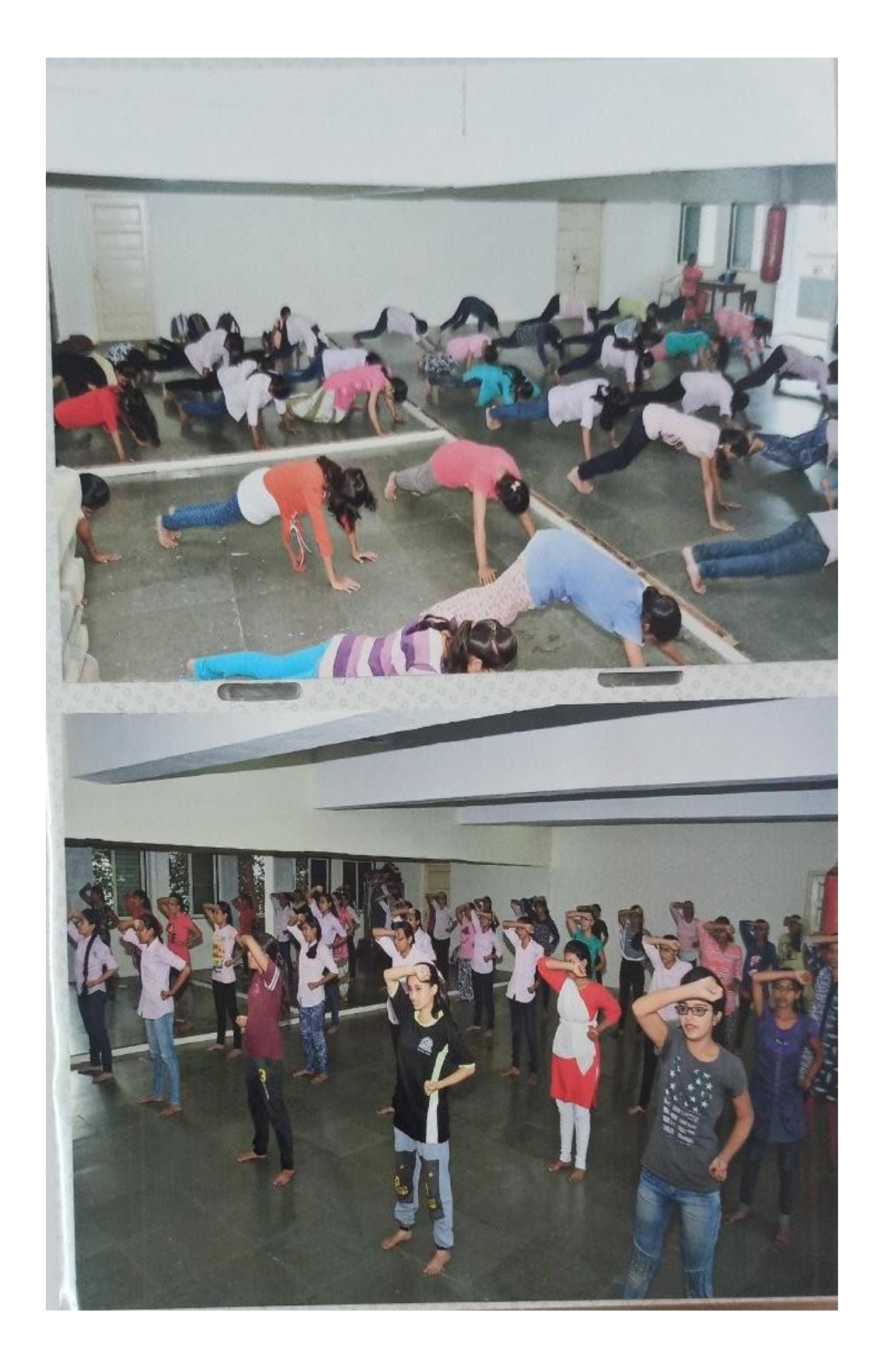
Tranning Judo and Karate for self Defense (Swayam Siddha Abhiyan)