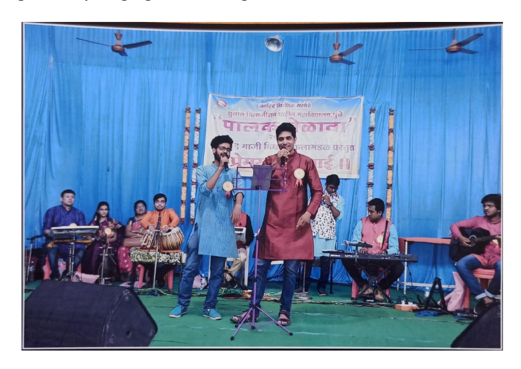
Mothers meet organized by Yuvati Sabha on the topic PreamswarupAai

A parent meeting was organized on 27th December 2019 under Yuvti Sabha, on this occasion the former students of the college presented the concept of 'Prem Swaroop Aai' by singing soulful songs.