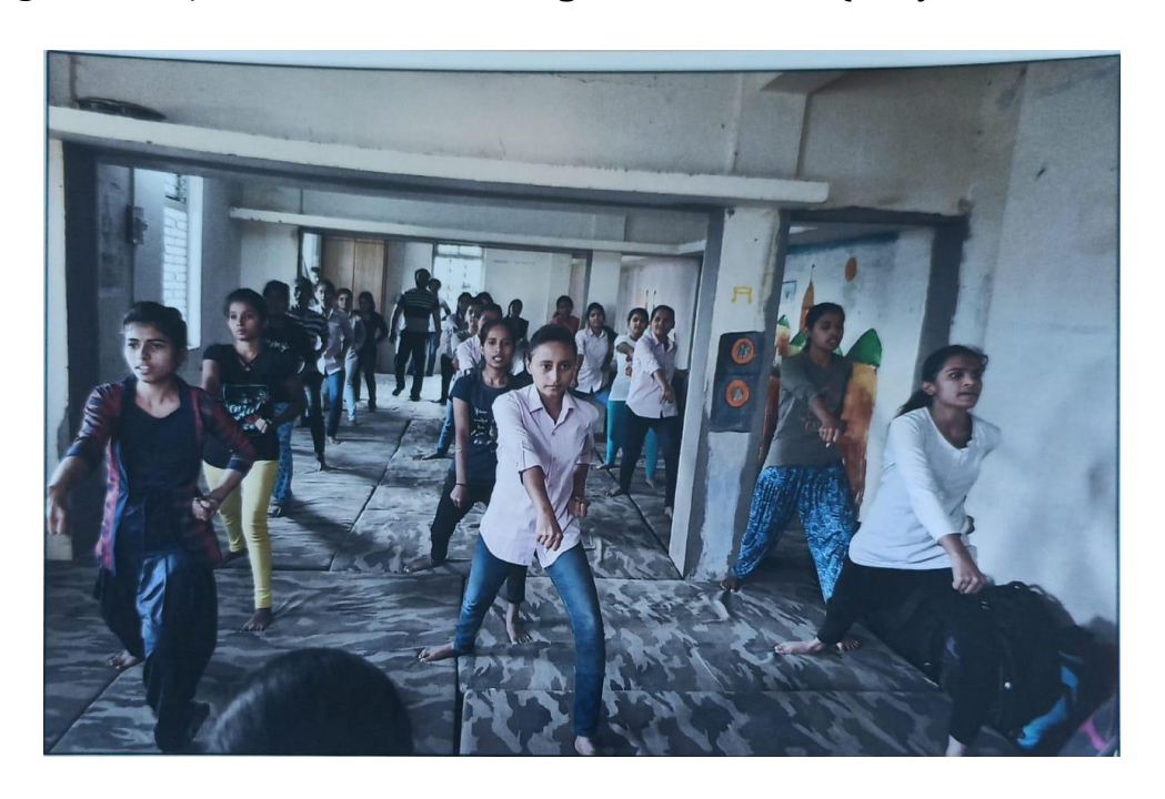
Judo and Karate training for self Defense (Swayam Siddha Abhiyan)