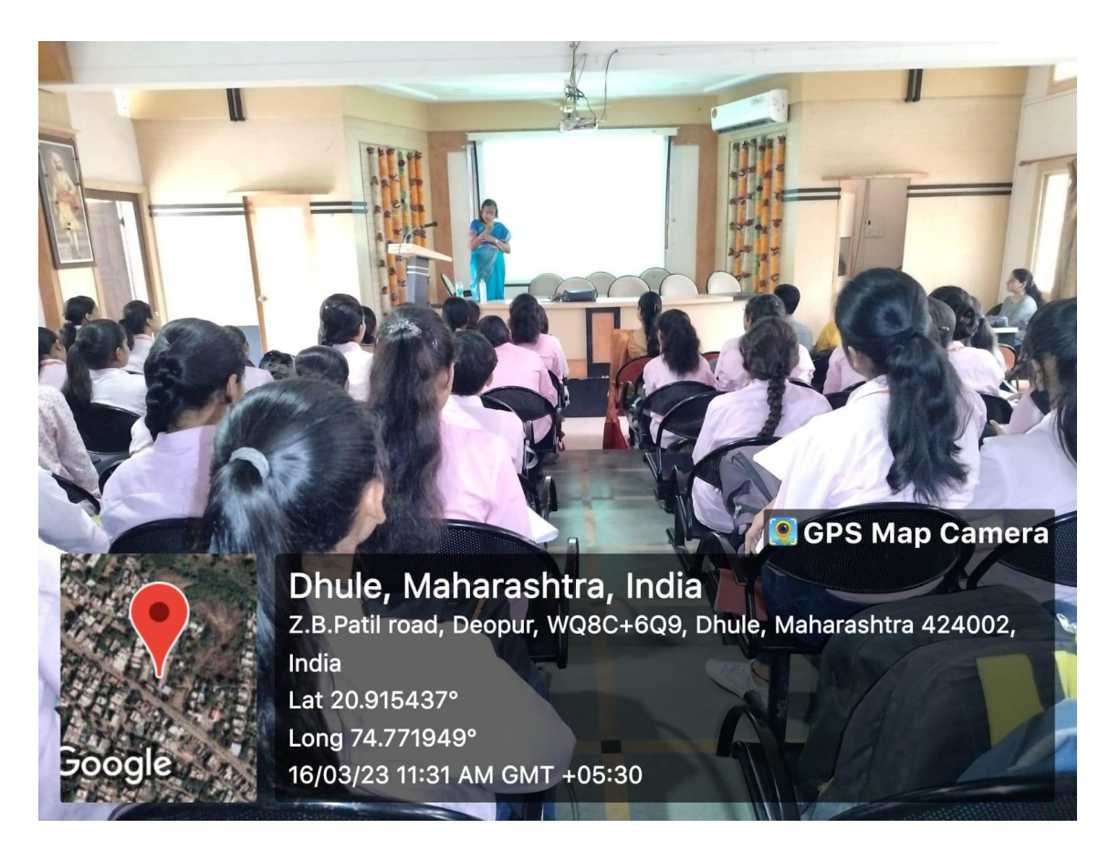
six-day women's Atmanirbhar (self-reliant) campaign