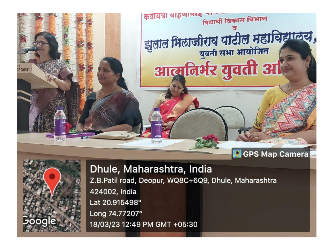
six-day women's Atmanirbhar (self-reliant) campaign