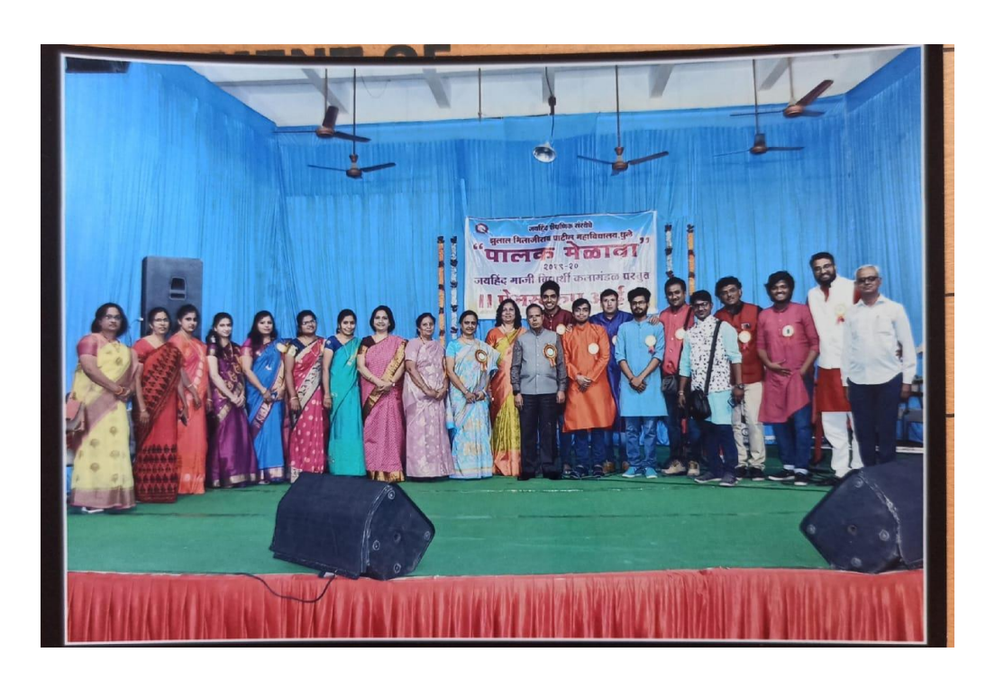
Mothers meet organized by Yuvati Sabha on the topic Preamswarup Aai