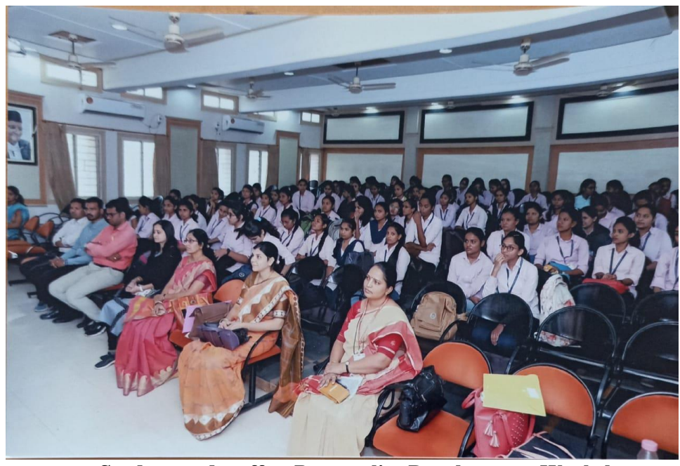
Student and staff at Personality Development Workshop