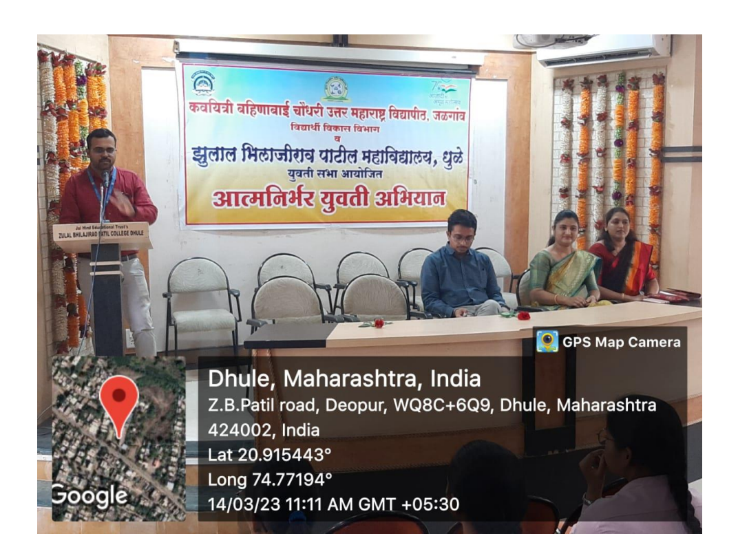
six-day women's Atmanirbhar (self-reliant) campaign