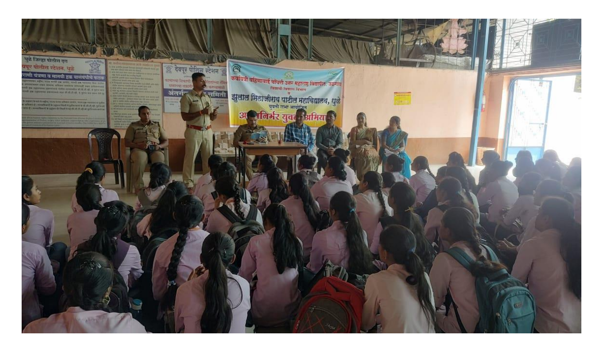
students visited Deopur Police Station under the six-day women's Atmanirbhar (self-reliant) campaign